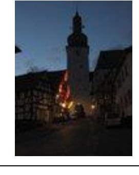
Bell Tower of Arnsberg, North Rhine-Westphalia