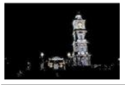
Dolmabahçe Palace, Istanbul, Turkey