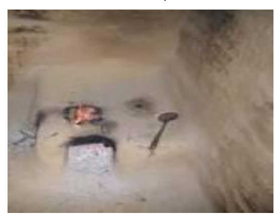
Traditional mud stove used in villages in India

The first real-world, head-to-head comparison of "improved cookstoves" (ICs) and traditional mud stoves has found that some ICs may at times emit more of the worrisome "black carbon", or soot, particles that are linked to serious health and environmental concerns, than traditional mud stoves or open-cook fires.