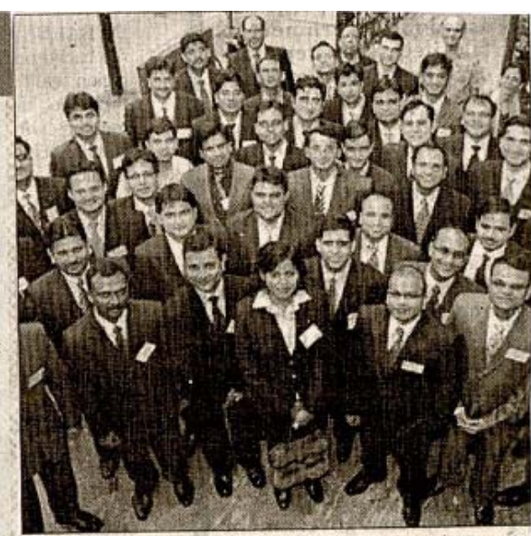
The biggest challenge before future managers lies in developing unconventional leadership.

IIM Lucknow's Noida campus recently announced the organisation of "CEO Conclave 2009: Business Strategies for Rural India". The conclave aims to bring together industry leaders who have worked in rural India to discuss new innovations in rural supply chain management; how distribution models are being redefined; business development strategies for rural markets; issues in rural health care; business models for sustainable strategies in rural market and shaping rural markets. The conclave will witness the participation of industry experts, academicians and policy makers.